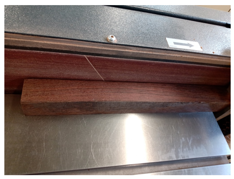
Figure 3, please note timber against the stop and trailing edge making contact first