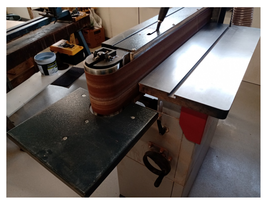
Figure 1, The Hammer belt sander